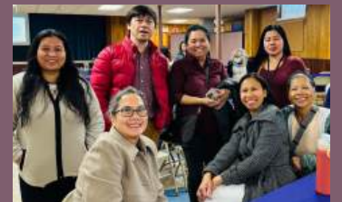
Thank you to all who cooked, served, and helped clean up!