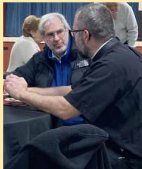
Mary conceived without sin, pray for us who have recourse to Thee!