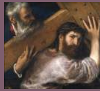
STATIONS of the CROSS and FILIPINO NIGHT with the Sacred Heart Knights of Columbus