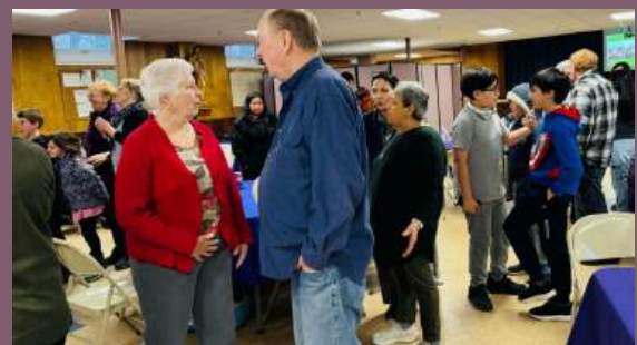
Hope to see you all soon at one of our upcoming dinners!